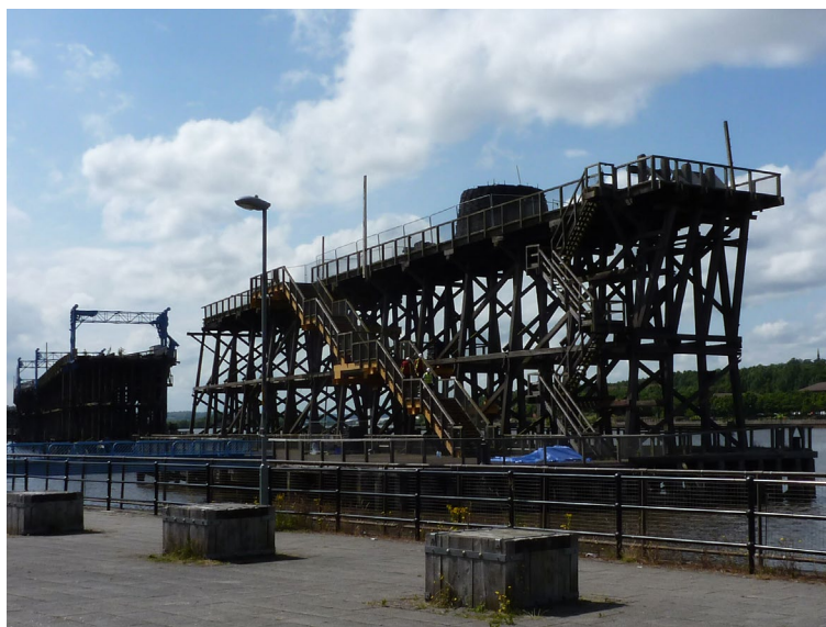
Figure 2. Wolfgang Weileder at Dunstan Staiths while working on Cone.