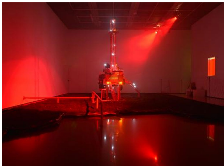
Figure 9. HeHe, Fracking Futures , Installation, FACT, Liverpool.